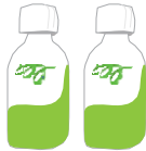
Two bottles of CLENPIQ (5.4 oz each)